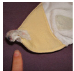
Hair, lint and other "stickies" get caught in Velcro tabs

These diapers were sent to us by an actual cloth diaper user who was deeply dissatisfied with diapers utilizing Velcro closures. The diapers pictured were washed daily for four months. We did NOT alter these diapers or photos in any way.