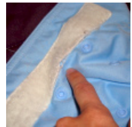
Velcro strip coming detached from diaper